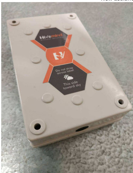
Fig. 1: (above): Satellite communication hub items