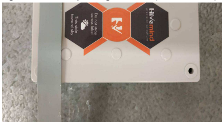
Fig. 2: Do not strap over green label (antenna area)